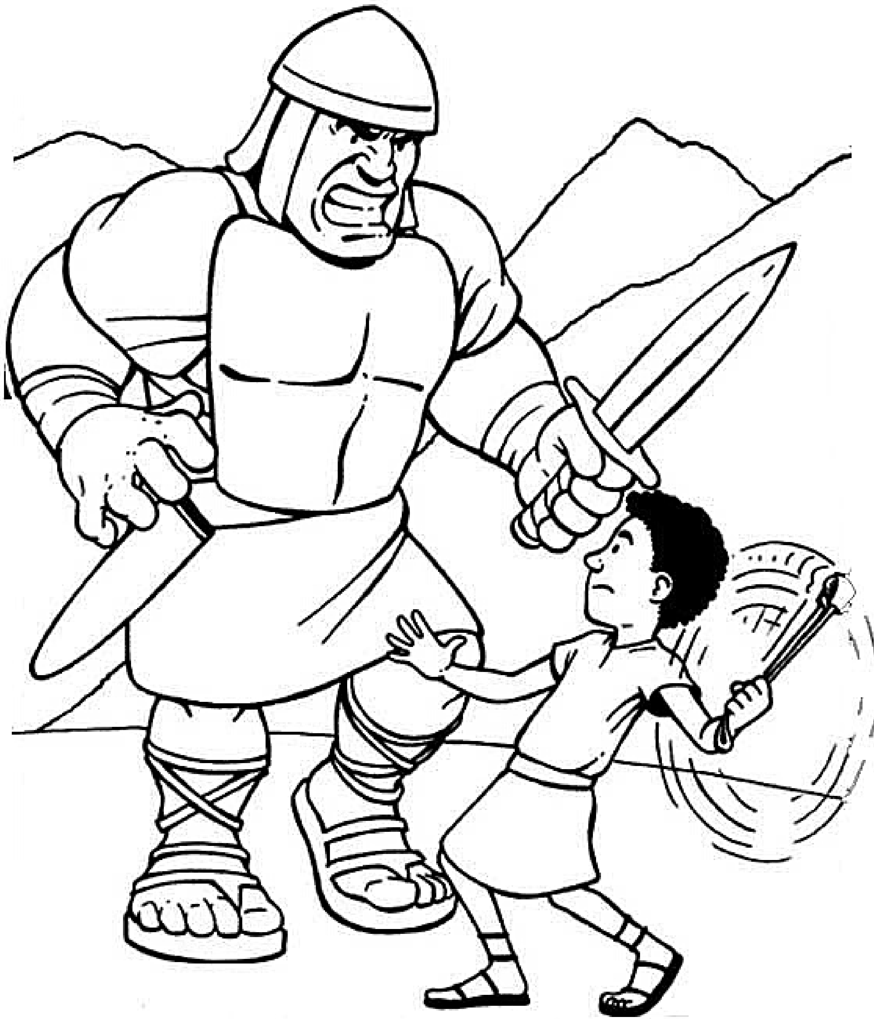
David & Goliath